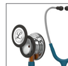
5874 Caribbean Blue