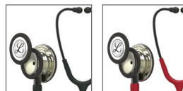
5861 Black 5864 Burgundy