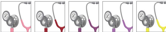
5633 Pearl Pink 5627 Burgundy 5831 Plum 5832 Lavender 5839 Lemon-Lime