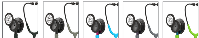
5811 Black 5812 Dark Olive 5872 Turquoise 5873 Gray 5875 Lime Green