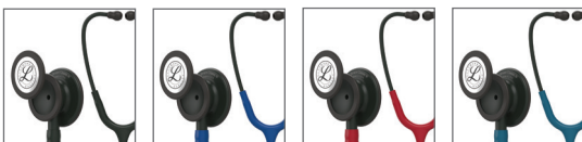
5803 Black 5867 Royal Blue 5868 Burgundy 5869 Caribbean