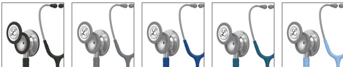
5620 Black 5621 Gray 5622 Navy 5623 Caribbean 5630 Ceil Blue