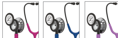
5862 Raspberry 5863 Navy 5865 Lavender